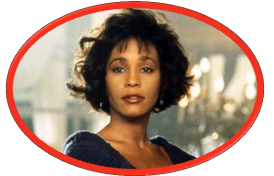
Franchise Business Consultant