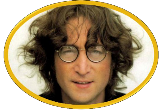
Franchise Business Consultant